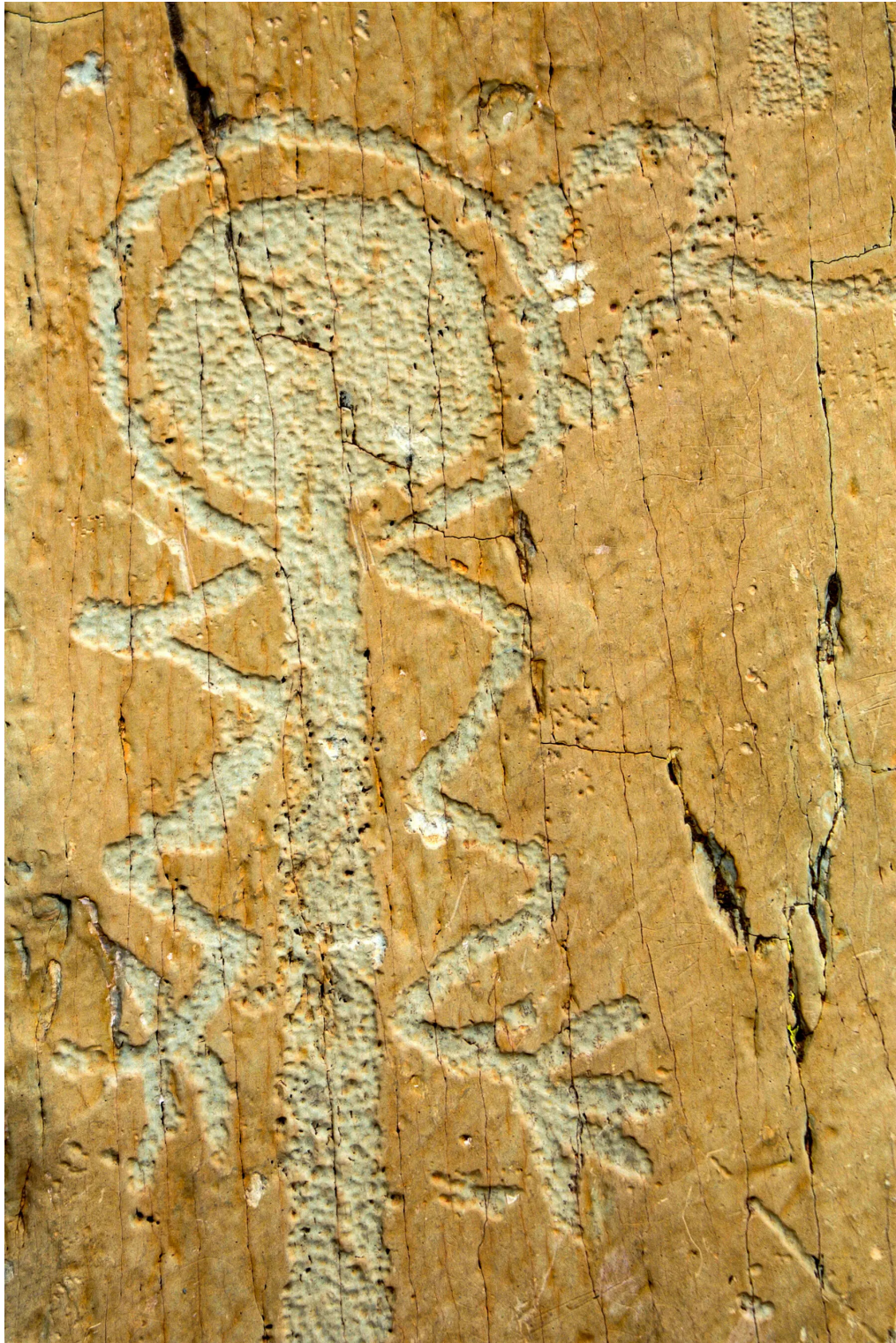
Petroglyphs at Mount Bégo, Valley of Marvels, in southern France.