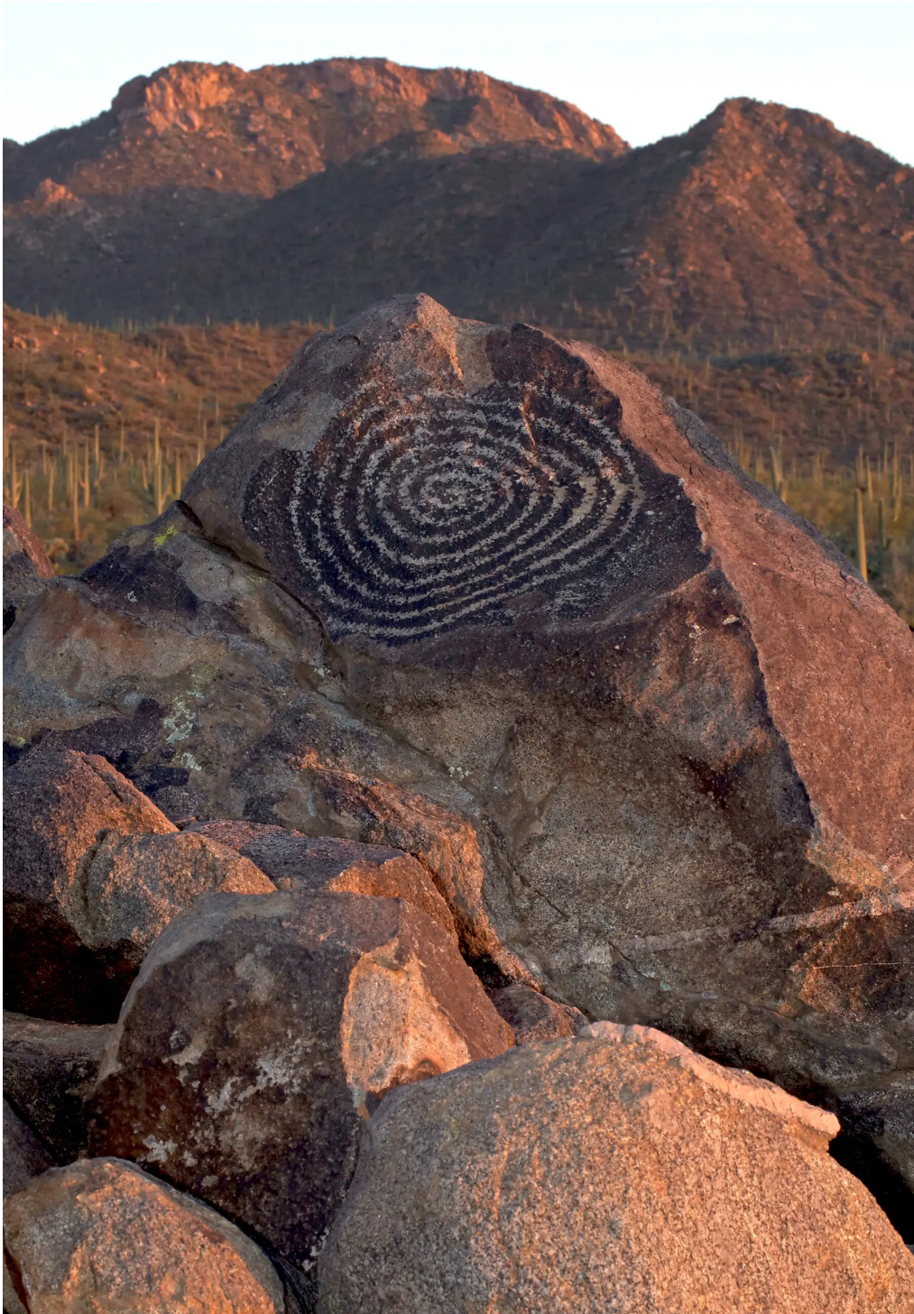
A spiral stone engraving on Signal Hill in Saguaro National Park, Arizona, dated 550 to 1,550 years ago.

Next the researchers used an A.I. algorithm called DreamCoder, developed a