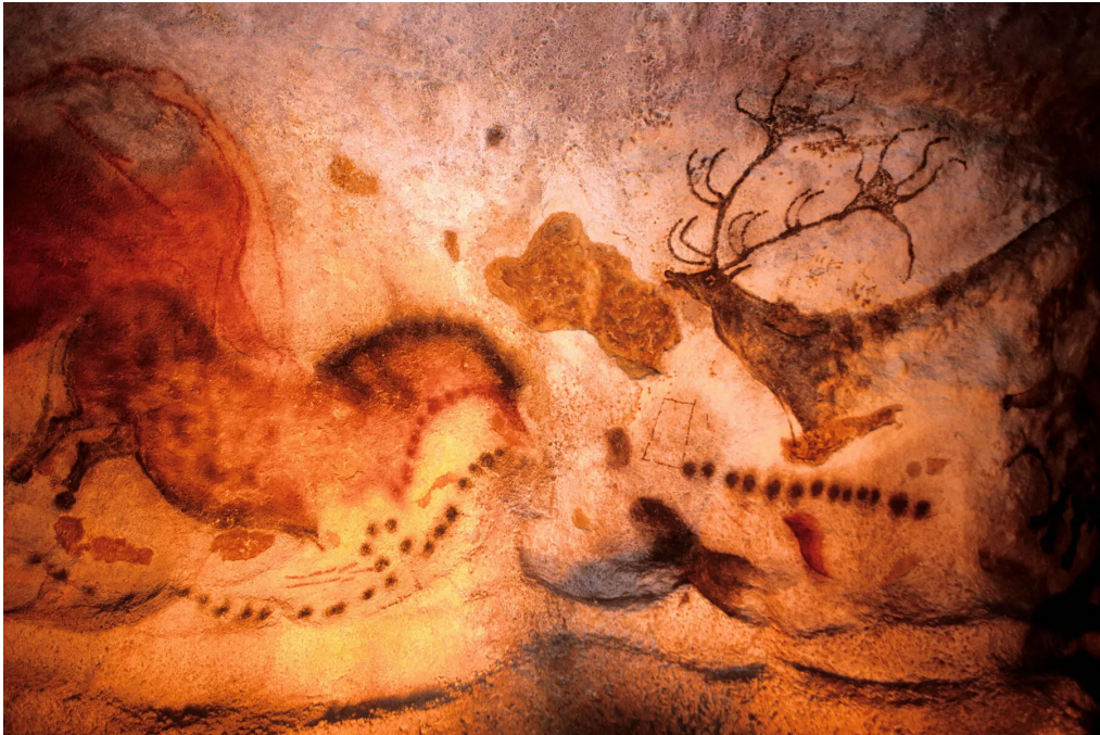
Geometric shapes appear below the Megaloceros, a giant extinct deer, in the Lascaux, France, cave paintings, which are thought to be 17,000 years old.