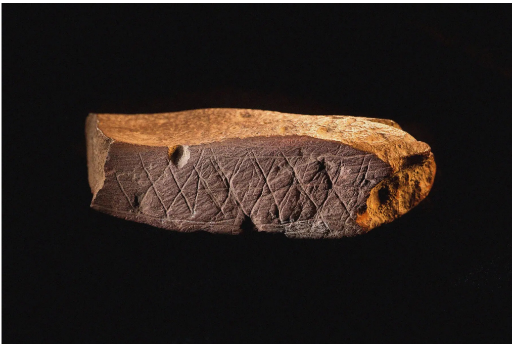
An engraved slab from the Blombos Cave in South Africa, dating to 70,000 years ago.